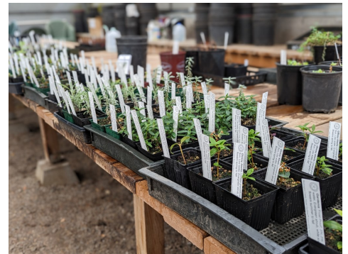
A few of the plants being readied for sale by the propagation team